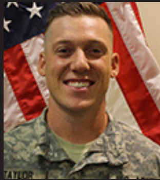
c/ Major Taylor